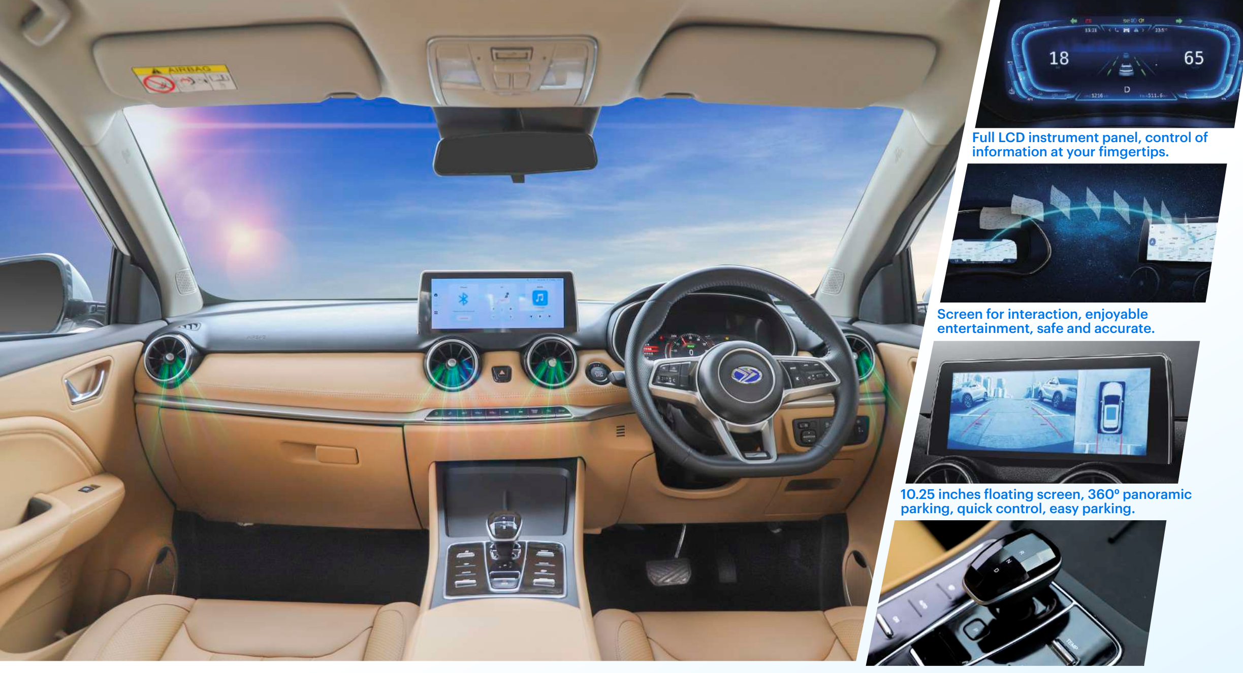
Electronic Shift Knob