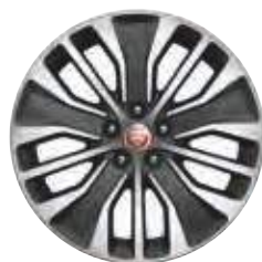
18" 5 Split-Spoke 'Style 5055' with Diamond Turned finish