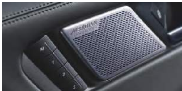
Meridian™ Surround Sound System (825W)