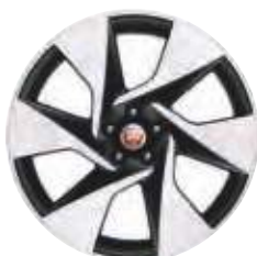
20" 6 Spoke 'Style 6007' with Diamond Turned finish