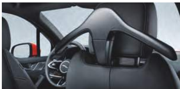
Click and Hang