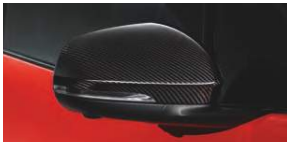
Carbon Fiber Mirror Covers