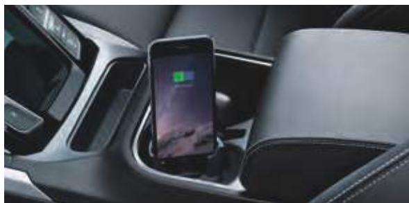
iPhone Connect and Charge Dock