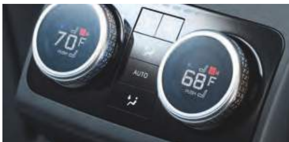
Four-zone Climate Control