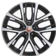
22" 5 Split-Spoke 'Style 5070' in Technical Grey with Polished finish