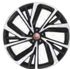
22" 5 Split-Spoke 'Style 5056' with Diamond Turned finish