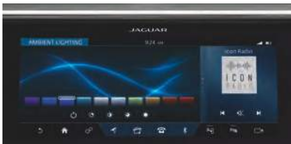
Configurable Ambient Interior Lighting