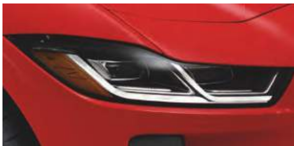
Premium LED Headlights with Signature DRL