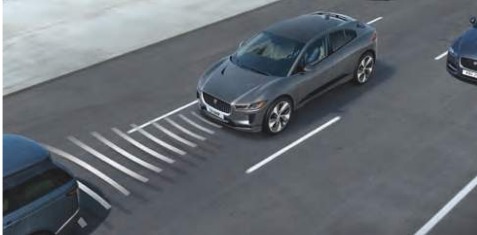
Adaptive Cruise Control with Stop & Go