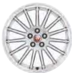
18" 15 Spoke 'Style 1022'