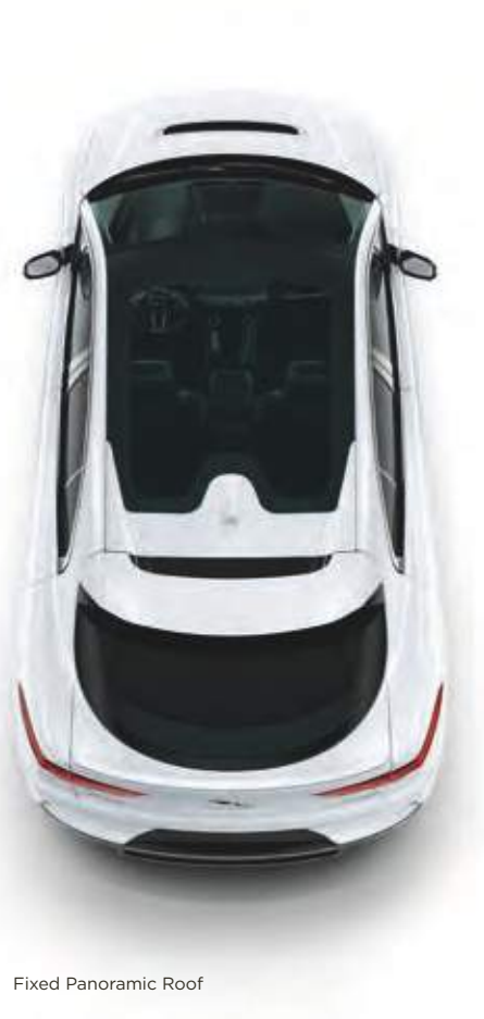
Fixed Panoramic Roof