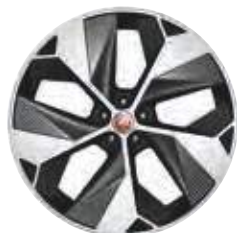
22" 5 Spoke 'Style 5069' in Gloss Black with Diamond Turned finish and carbon inserts