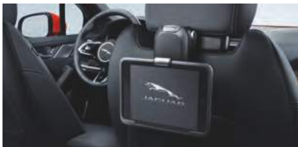
Click and Play