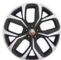
20" 5 Spoke 'Style 5068' with Diamond Turned finish