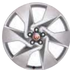
20" 6 Spoke 'Style 6007'