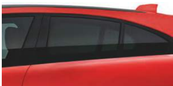
Gloss Black Side Window Surrounds