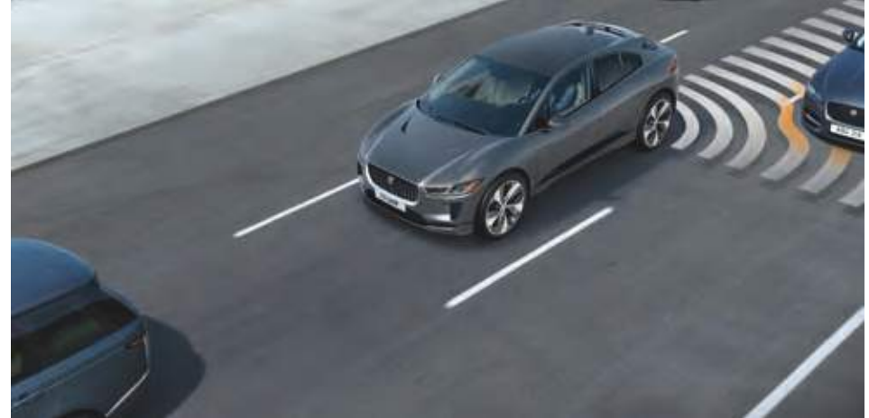
Blind Spot Assist