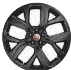
20" 5 Spoke 'Style 5068' with Gloss Black finish