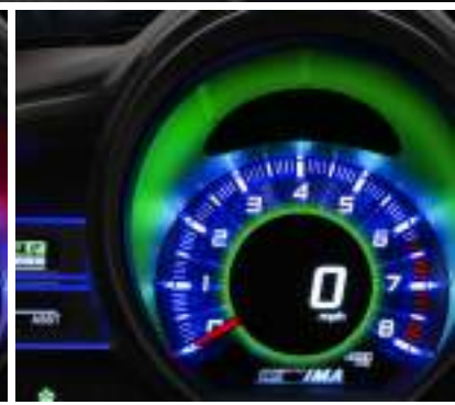
Need a performance boost? Press the S+ button and the Plus Sport System™ primes the CR-Z's engine for enhanced performance, no matter what mode you're driving in.